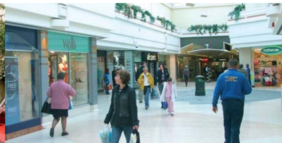
The Guildhall Shopping Centre