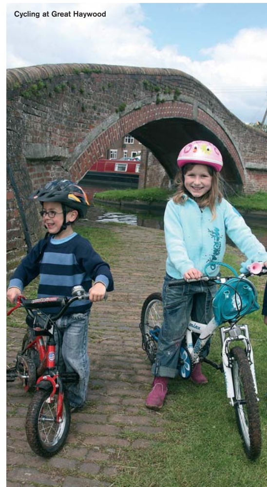
Cycling at Great Haywood

or the 'Children's Wild Animal Adventure' trail are a fun way to explore! A short drive away is a haven for the green fingered - Wollerton Old Hall Garden (Tel: 01630 685760 www.wollertonoldhallgarden.com ; moor in Market Drayton), featuring a knot garden and superb English summer flowers.