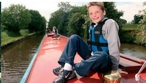
Boating at Brewwood