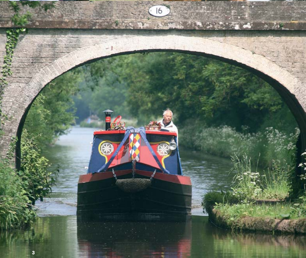
Photos: 1. Penkridge, 2. Eating by the water, 3. Boating at Brewood